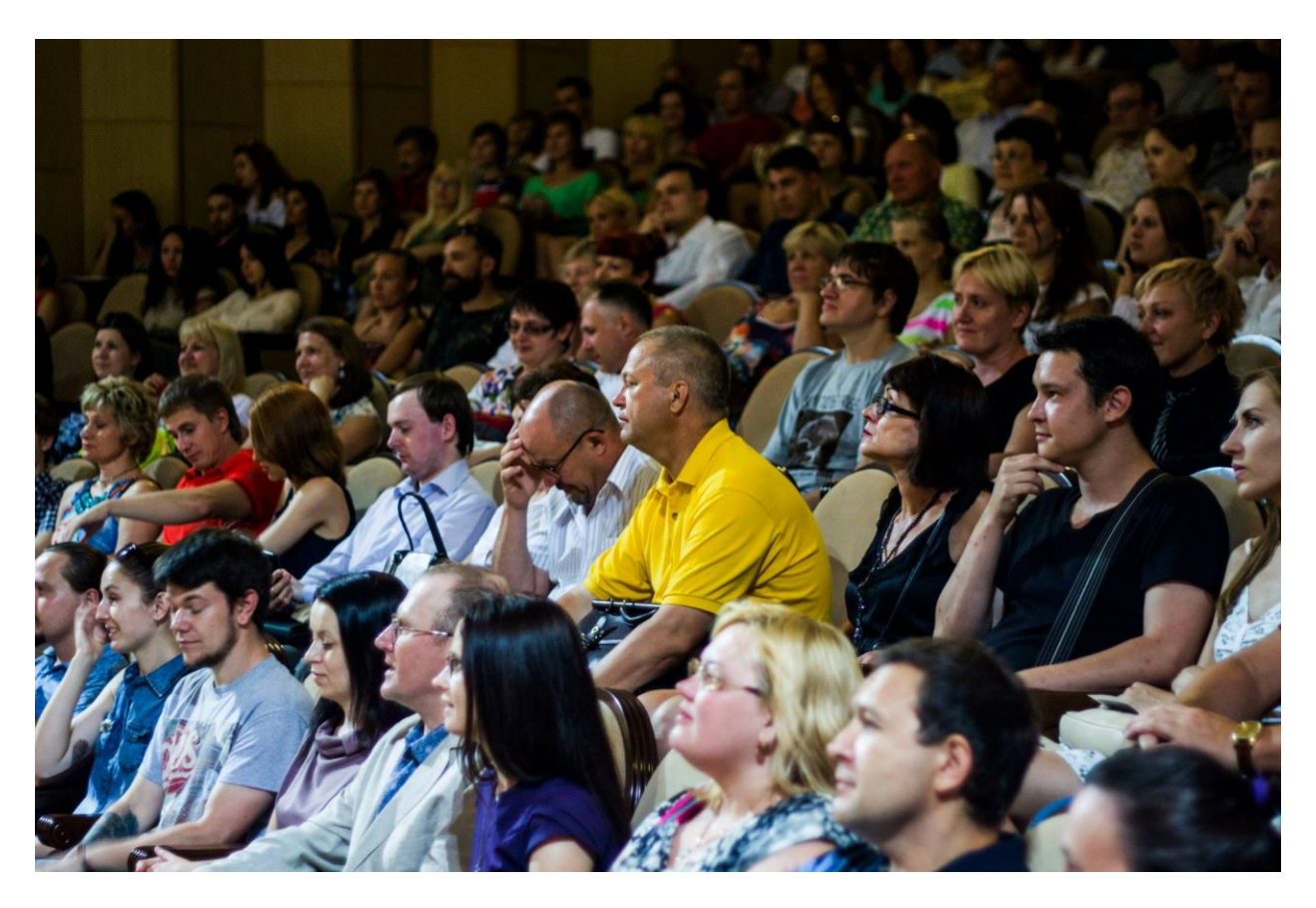
Both the U.S. and European musicians on tour were unanimous in observing that our Russian audiences were on the whole significantly larger and more appreciative of our far-from-mainstream music than is typically the case in our home countries. With the large number of musicians on board, our concerts were normally segmented into eight 20-minute sets; much to our surprise, it was not uncommon for listeners to take in more than three hours of music with undivided attention and enthusiasm.