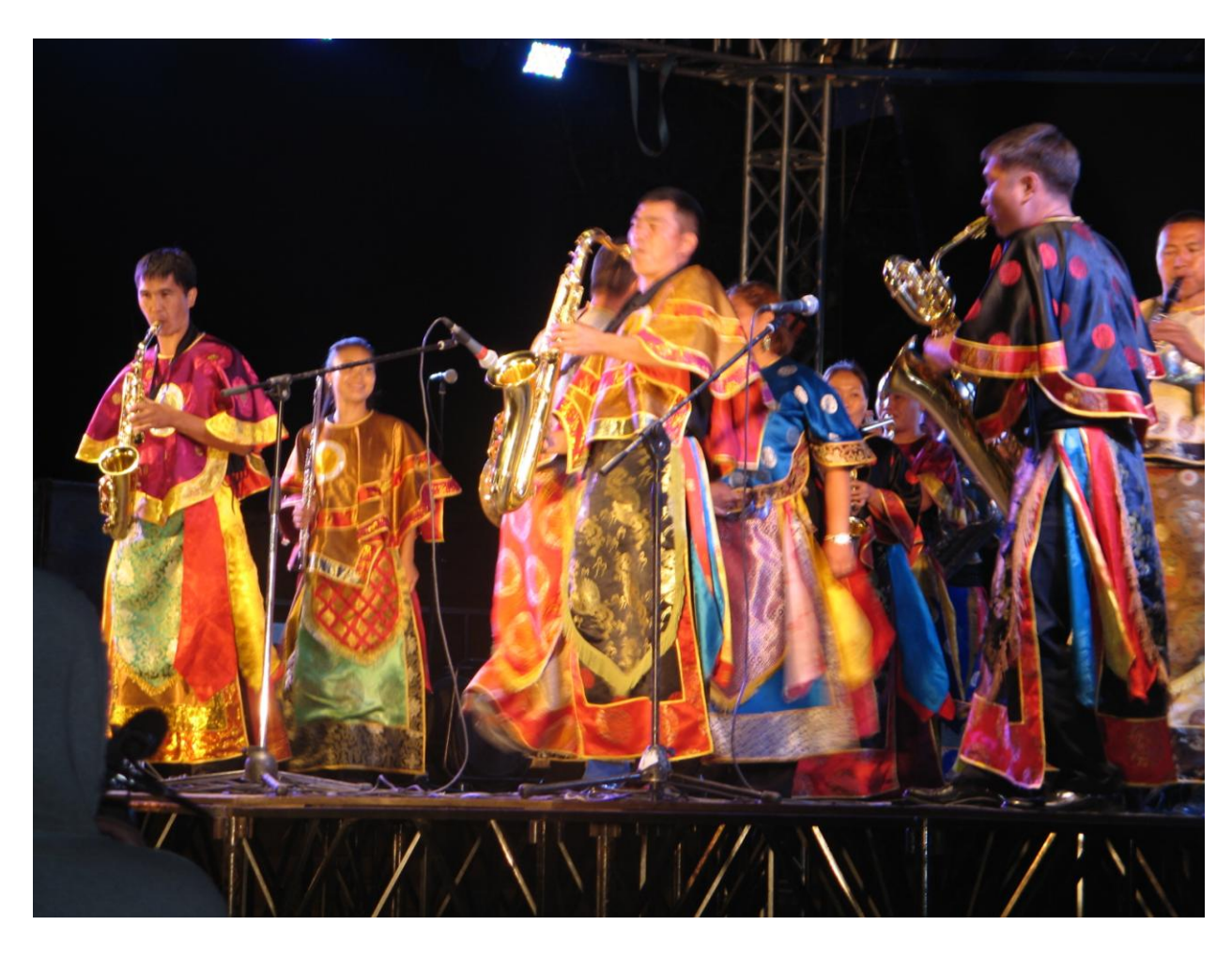
Tuvan National Brass Band