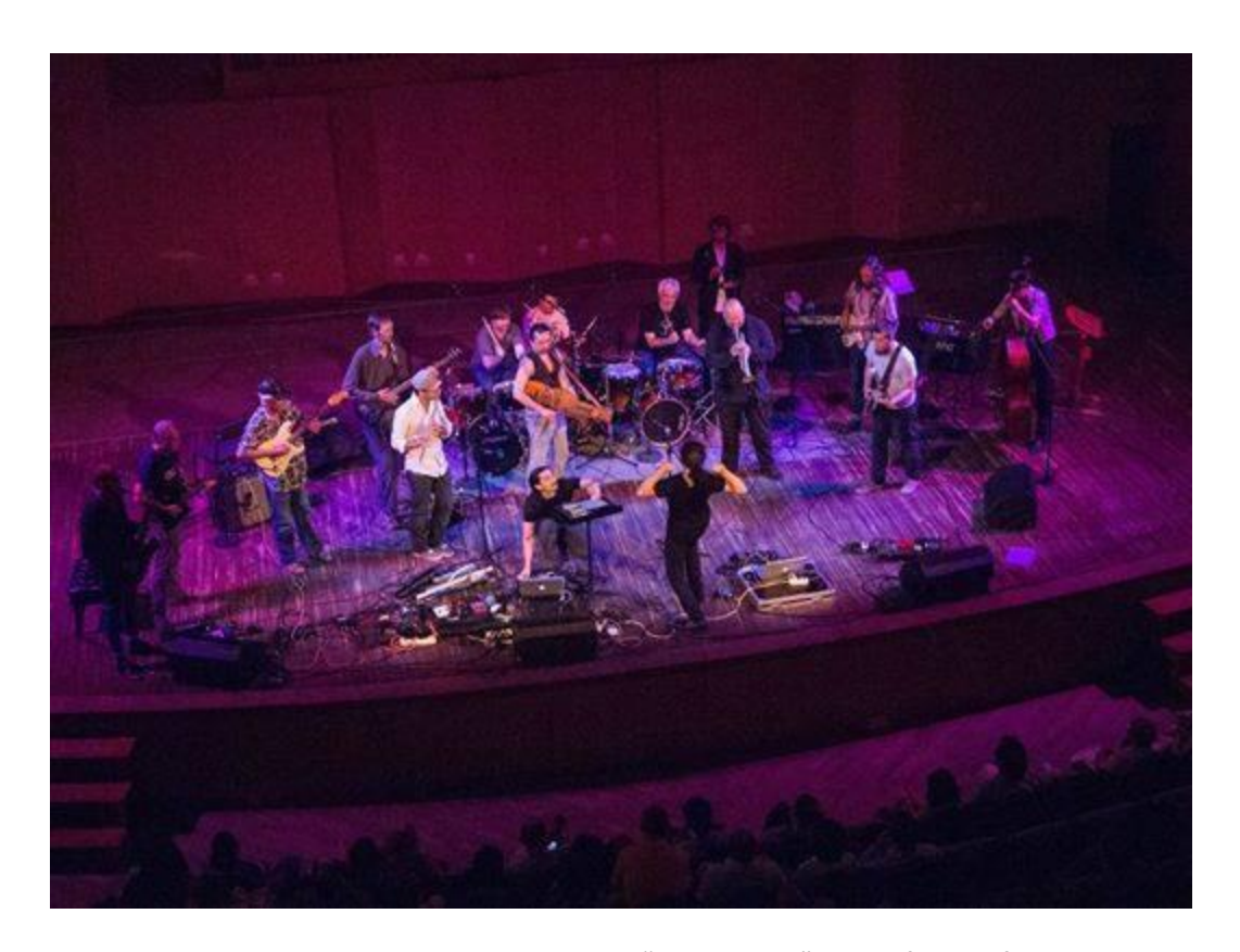
MuzEnergo musicians in a spontaneous mass "conduction" at the finale of a concert at Krasnoyarsk Philharmonic Hall.