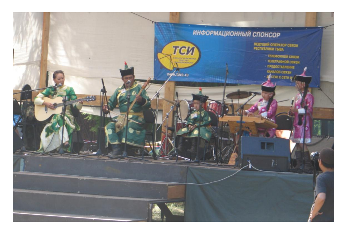
Family of traditional Tuvan musicians auditioning for Ustuu Huree Festival main stage.